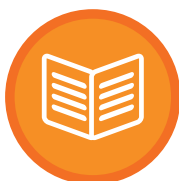
Teacher Cover Management